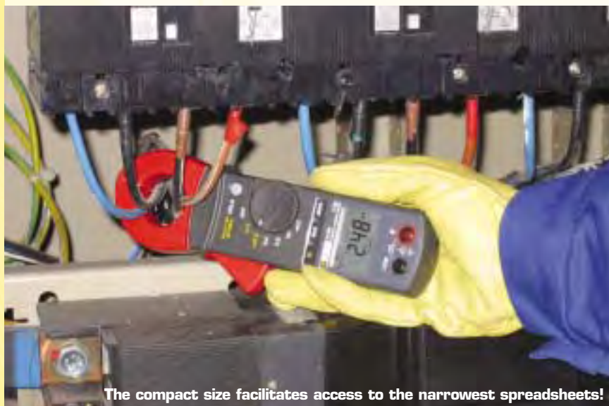
The compact size facilitates access to the narrowest spreadsheets!

For professionals of testing and maintenance in the industrial and tertiary sectors faced with this challenge, F62-F65 pocket-sized clamps are the recognised solution. While providing the full range of functions proposed by conventional multimeter clamps.